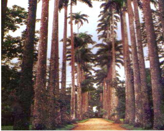
Botanical Gardens - Rio de Janeiro

anthropological sciences), which unfortunately burned down last year, and the Botanical Gardens, all in the city of Rio de Janeiro .