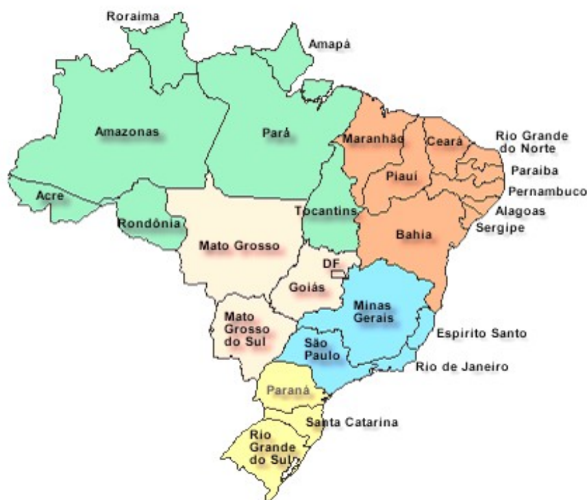
MAP OF BRAZIL

Today, Brazil is a Federative Republic comprising 26 states and one Federal District. The capital city of Brazil is Brasília , located in the Federal District, close to the geographic center of the national territory.