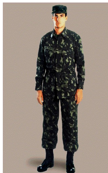
9 th B2

- For general and graduation ceremonies: 4 th Uniform and 5 th A1.