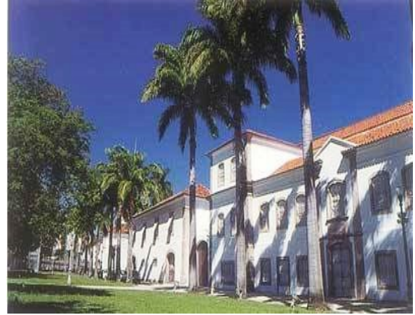
National Historical Museum - Rio de Janeiro

Also, in Rio de Janeiro , we have the National Historical Museum, a typical construction in the baroque-rococo (or late baroque) style, the Gustavo Capanema Palace, designed by French architect Le Corbusier, the National Museum of Fine Arts, The Museum of Modern Art, an example of contemporary architecture, and the Municipal Theater. The Imperial Museum, in the city of Petrópolis (Rio de Janeiro) , has a rich collection of pieces from the monarchic period.