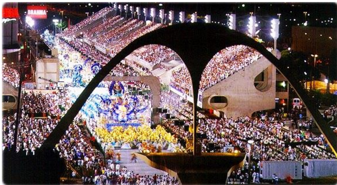
Carnival in Rio de Janeiro

The largest and most popular festivity of Brazil is the Carnival that generally takes place in February and lasts for four days. Carnival celebrations in Rio de Janeiro, Salvador, Recife and Olinda are famous all around the world. Another important event is the New Year's Eve celebration, held on the beaches of Rio de Janeiro and Salvador.