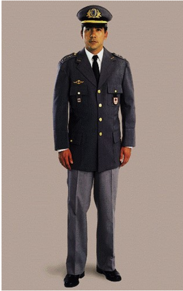
4 th Uniform