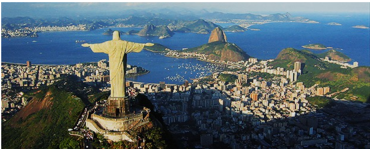
Rio de Janeiro

Rio is one of the most important economic, cultural and financial centers in the country. The city is internationally known for its various cultural and iconic landscape sites, such as the Sugar Loaf; Corcovado hill, with its statue of the Christ the Redeemer; as well as the beaches in Copacabana , Ipanema and Barra da Tijuca (among others); Maracanã soccer stadium; Nilton Santos Olympic Stadium; Rio de Janeiro Municipal Theater; the forests of Tijuca and Pedra Branca ; Quinta da Boa Vista Park; and the National Library, among many other attractions.