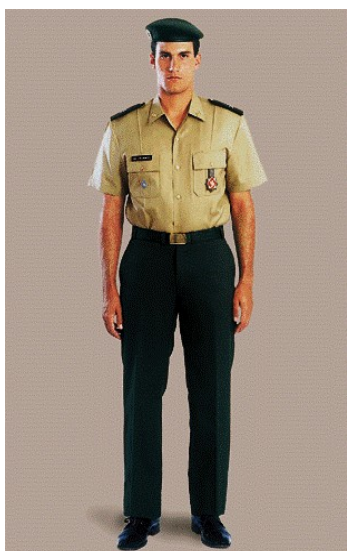
8 th B1

- For instructions sessions, trips and visits: 8 th B1 (with the olive-green jacket as coat) and the 9 th B2 (combat uniform), according scheduled.