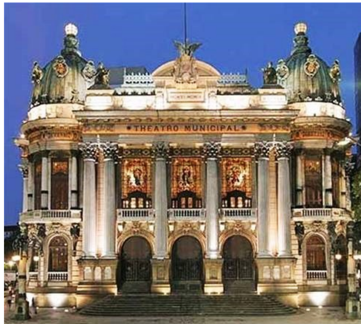
Municipal Theater - Rio de Janeiro

Also, in Rio de Janeiro , we have the National Historical Museum, a typical construction in the baroque-rococo (or late baroque) style, the Gustavo Capanema Palace, designed by French architect Le Corbusier, the National Museum of Fine Arts, The Museum of Modern Art, an example of contemporary architecture, and the Municipal Theater. The Imperial Museum, in the city of Petrópolis (Rio de Janeiro) , has a rich collection of pieces from the monarchic period.