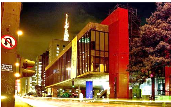
The Museum of Art of São Paulo (MASP)

collection and works by Aleijadinho. The Emílio Goeldi Museum, in Belém (Pará) , is an ethnology research center. In Manaus , the most important attraction is the Amazonas Theater , built at the time of the rubber cycle by the turning of the 19 th century.